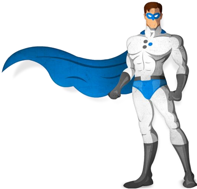
Product Manager PdM