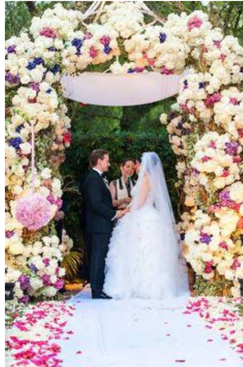
Clearly figure our RACI